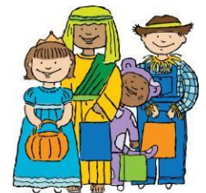
Trick or Treat Open House

The Welcoming Committee will host a Trick or Treat open house at the Youth Center on October 26, 6 to 8 PM. "Treats" and hot chocolate will be served. Please consider donating a bag of candy....last year we had over 200 visitors! The candy can be placed in the back of the kitchen. If any youth would like to help hand out candy, we welcome you in person or in costume!! Thank you!