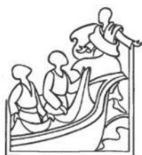
1. The Catch and the Call —Luke 5:1-11

Refrain: Along the road with Jesus, come follow, follow, everyone. Along the road with Jesus, come with us, and sing this song.