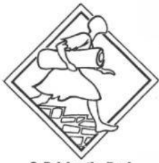
2. Raising the Roof —Luke 5:17-26

Refrain: Along the road with Jesus, come follow, follow, everyone. Along the road with Jesus, come with us, and sing this song.