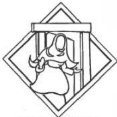
4. Mary and Martha —Luke 10:38-42

Far away from the nearest town, Jesus sits all the people down. Blesses the fish and breaks the bread, and we see multitudes of people fed.