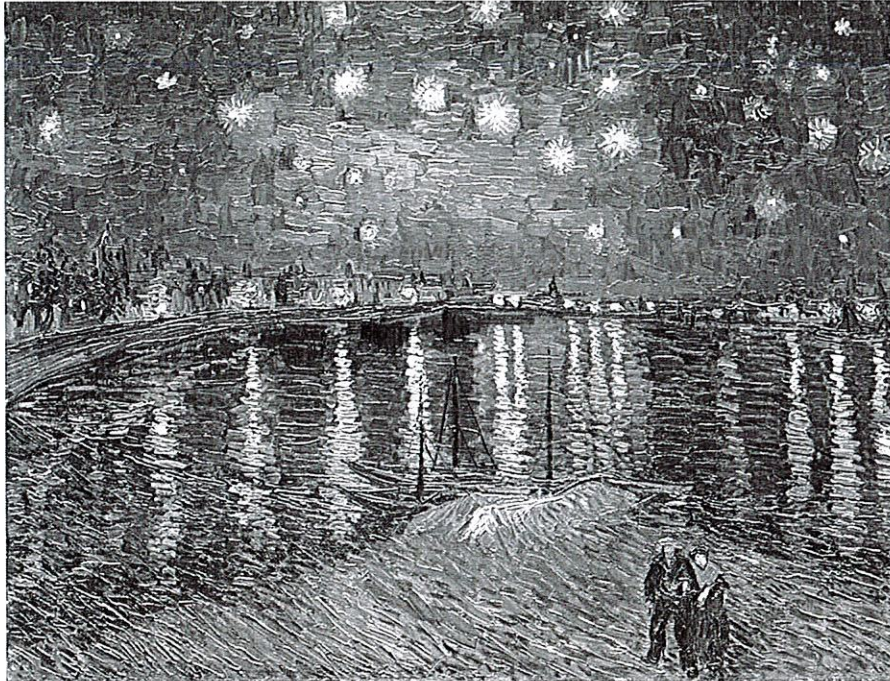
"Starry Night" | from Art in the Christian Tradition | Vincent van Gogh | 1888 | A Project of Vanderbilt Divinity Library

MECHANICSBURG PRESBYTERIAN CHURCH 300 East Simpson Street • Mechanicsburg, PA 17055-6596 717-697-0351 • www.mechpresby.org February 25, 2024 • Second Sunday in Lent • 8:15 & 11:00am